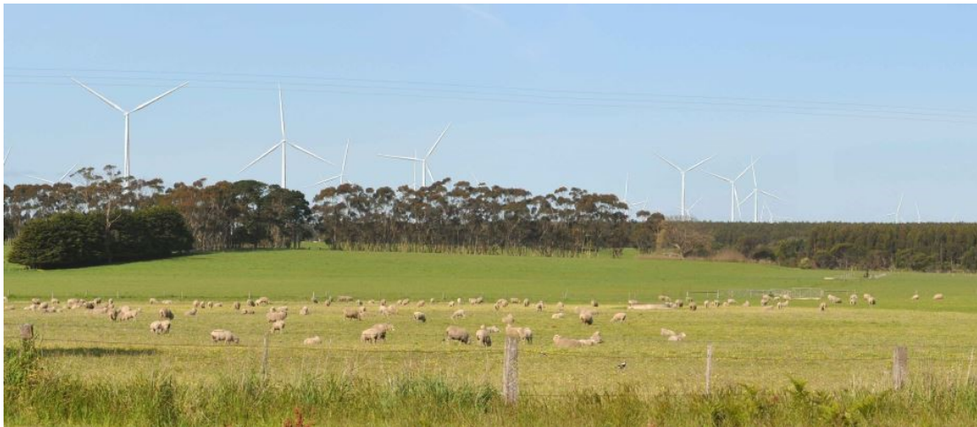
Photomontage of the proposed Willatook Wind Farm, from the Hamilton-Port Fairy Road, north of Orford.

An Environment Effects Statement Referral (EES Referral), based on the current proposed 83 wind turbine layout, has been lodged with the Minister for Planning. This will establish the need for an Environment Effects Statement. Further information on this process is provided below.